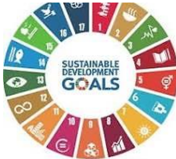
Figure 1. The United Nations Sustainable Development Goals 2030.

The Core Values of ESD include lifelong learning, democracy, equality, peaceful coexistence, and environmental protection. Although educational systems have the potential and responsibility of leading the global orientation towards the actualization of sustainable development, however, experience has shown that rigid acceptance by the formal educational systems is a barrier. To Implement ESD in the School systems, the schools have to be open to this initiative and key into the process of learning and internalization. ESD is in line with the basic fundamental pillars of learning: Learning to live together, learning to know, Learning to be, Learning to do, Learning to transform oneself and learning to transform the society.