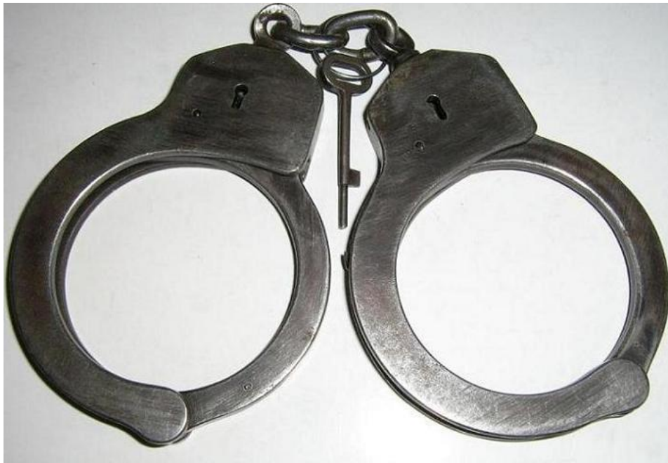
Photo 6. Handcuffs.