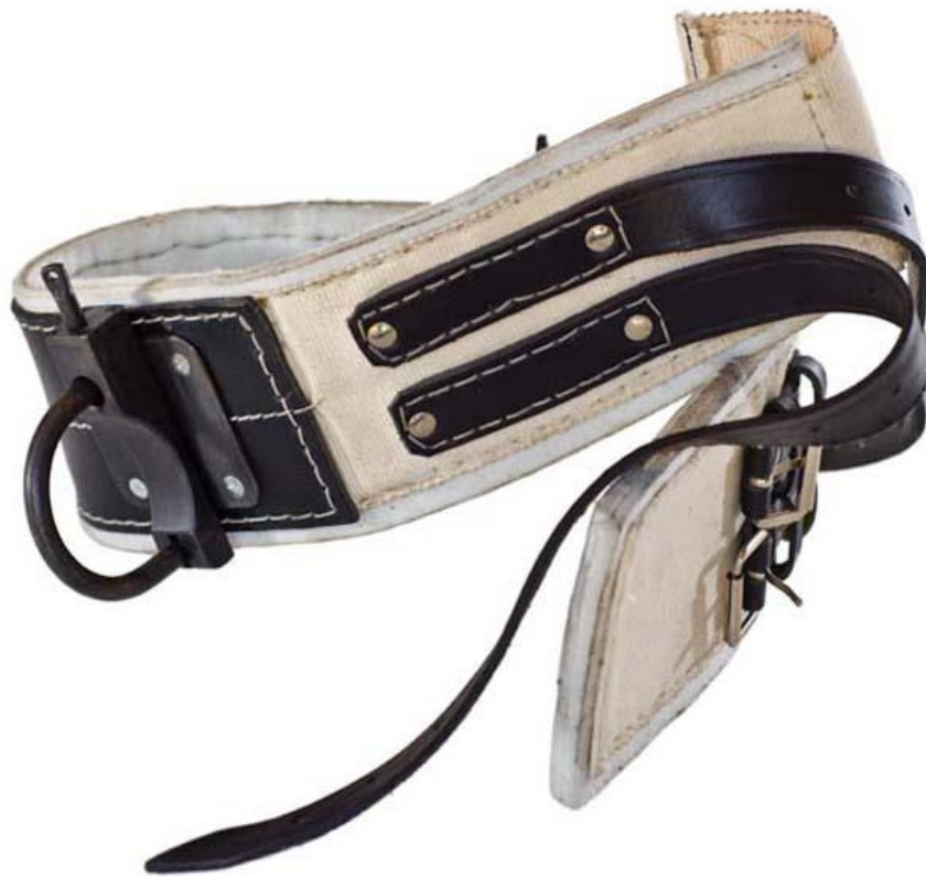
Photo 5. One-piece safety belt