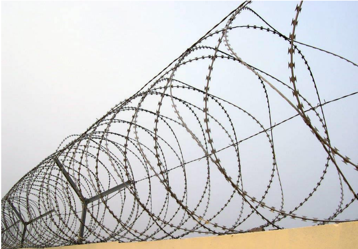
Photo 7. Wire entanglements.

The barriers used in the total institutions involve, amongst others: