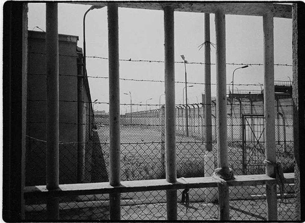
Photo 1. Bars on windows, wire fences, walls typical for penitentiary units.