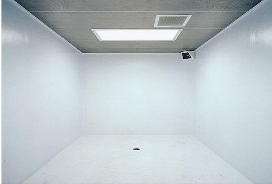
Photo 3. Room for emotional calm down in a psychiatric hospital.