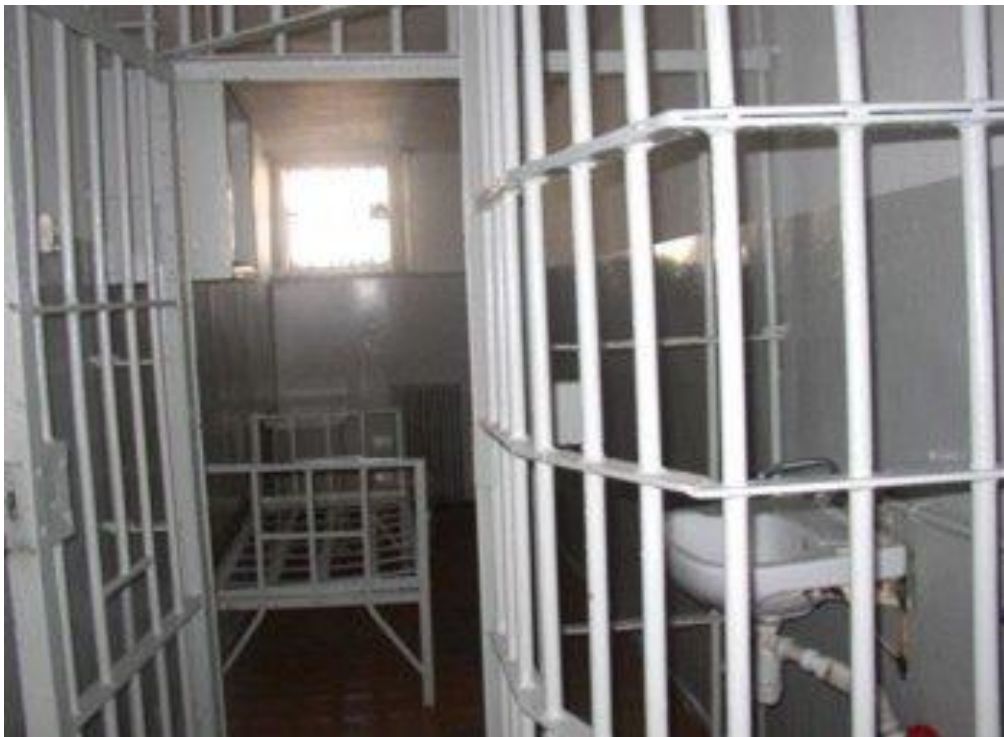
Photo 2. Isolation cell in a correctional facility.